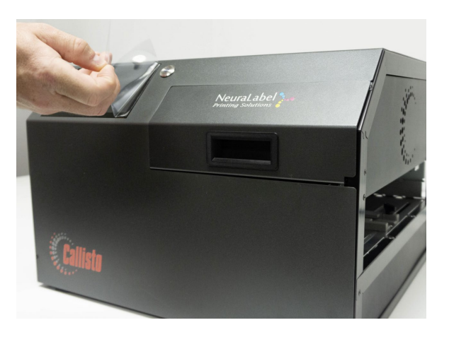
Remove screen cover.