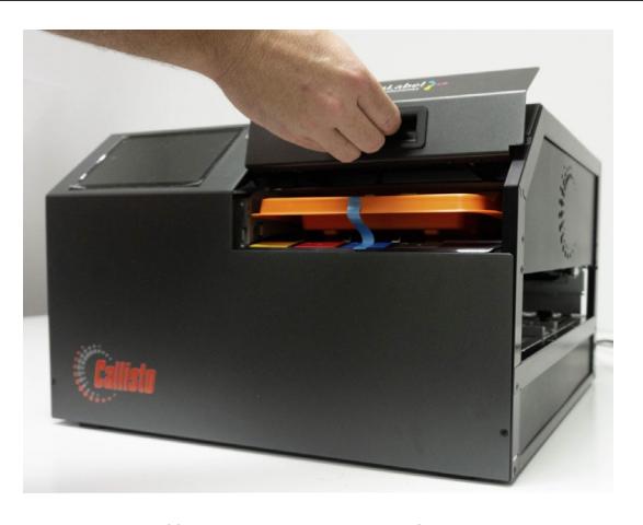
Pull out orange ink cap and blue tape.