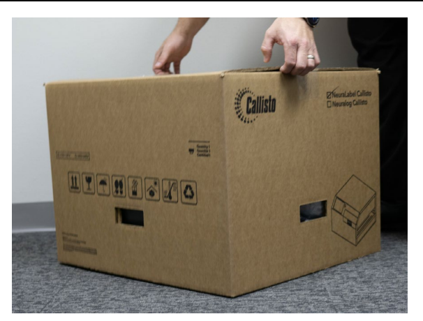
Lift upper box lid from lower box.