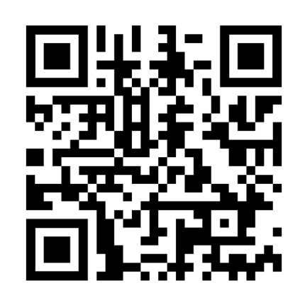
Watch the Setup Video