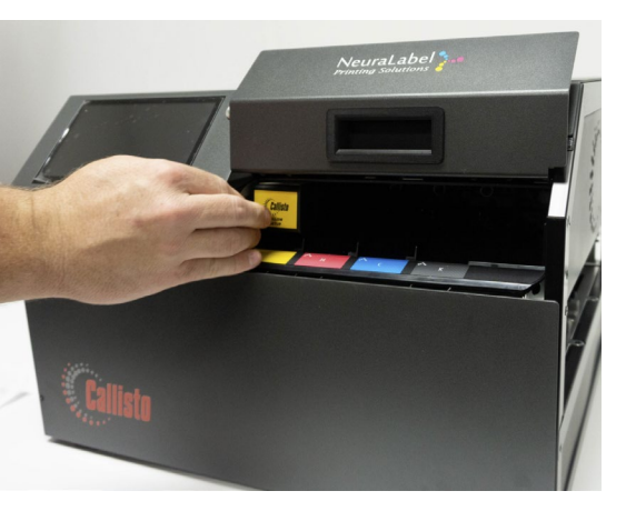
Install ink by pushing in until cartridge clicks into place.