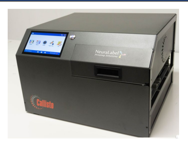
In about 2 minutes Printer Ready displays in lower left display corner.