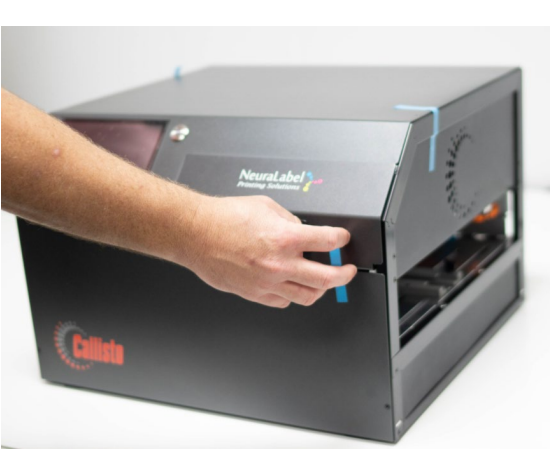
Remove blue packaging tape.