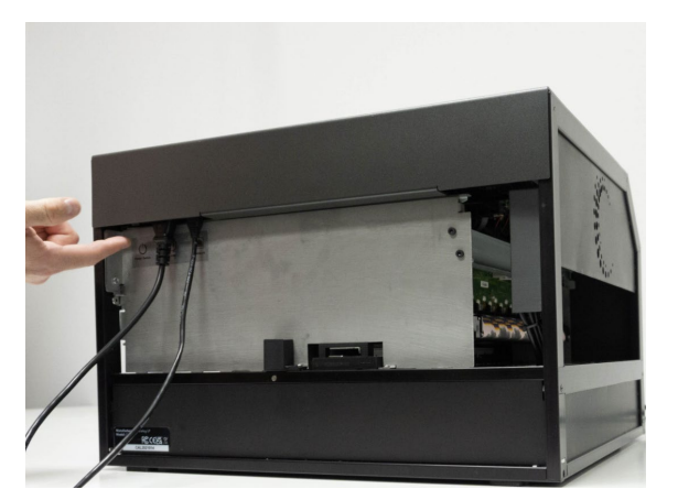
Plug in power and network cables. Turn on power switch.