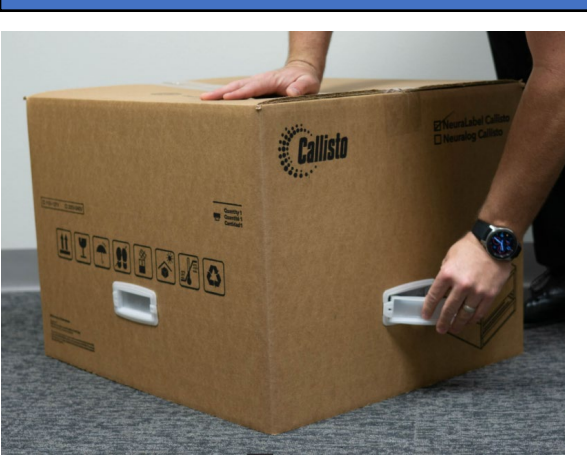
Remove white handles. Do not cut box tape.