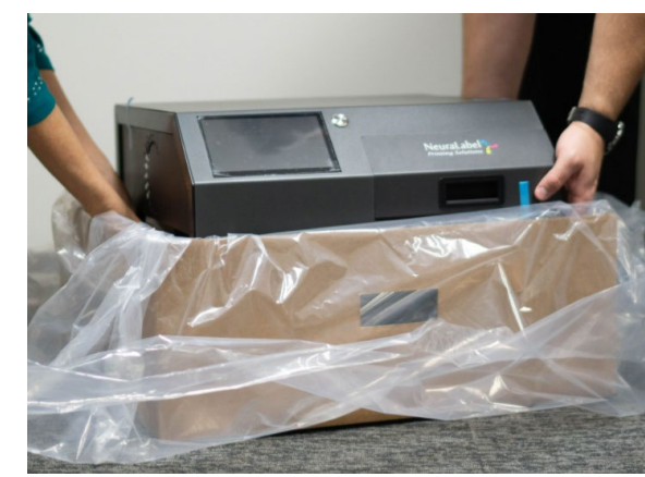
Lift printer with 2 people and set on sturdy table.