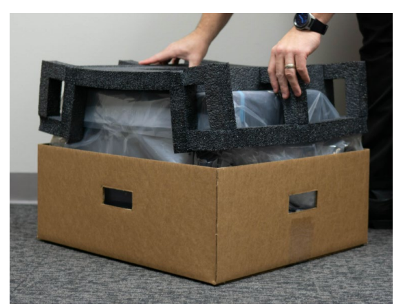
Remove outer packaging.